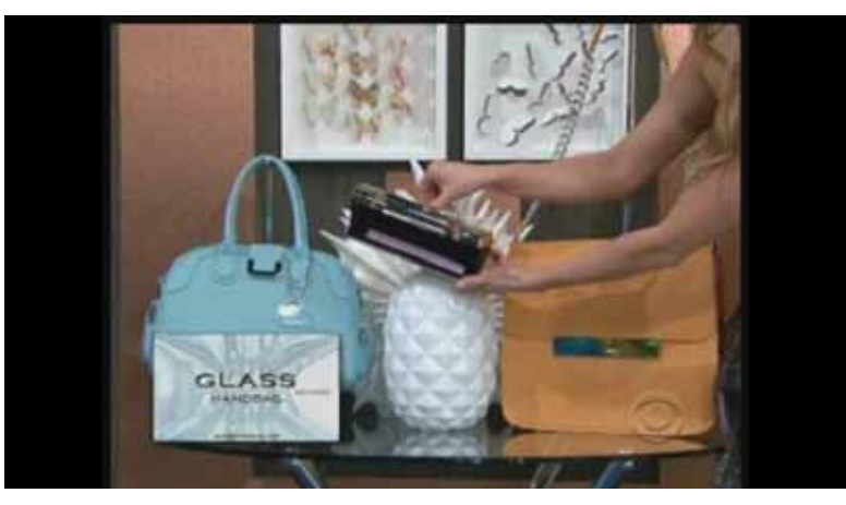
Steve Harvey Show Christmas Gift Guide special 12/17/2012