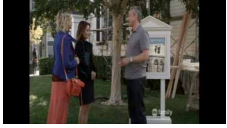
Price Is Right, CBS